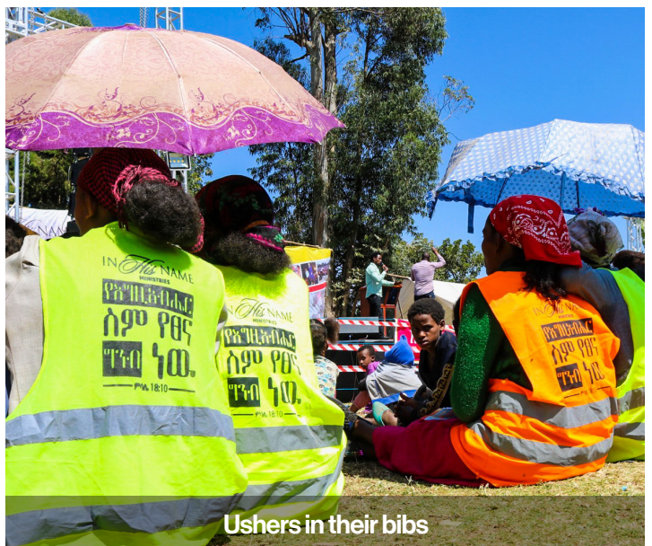
Ushers in their bibs