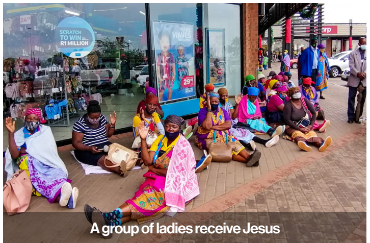
A group of ladies receive Jesus