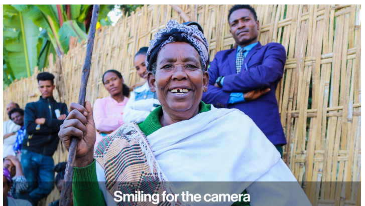
Smiling for the camera