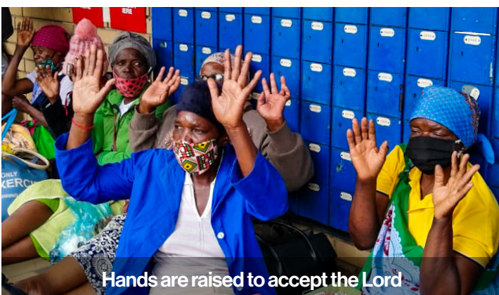
Hands are raised to accept the Lord