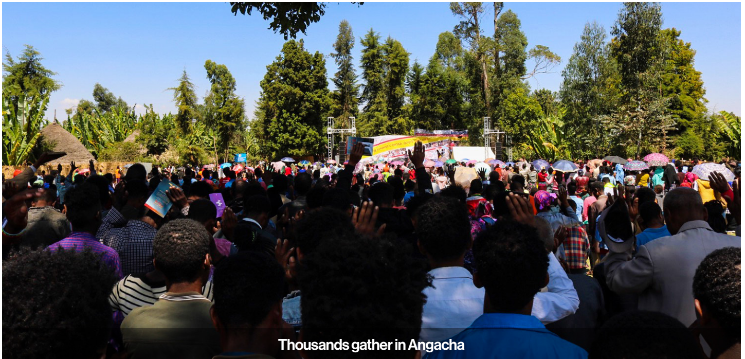
Thousands gather in Angacha