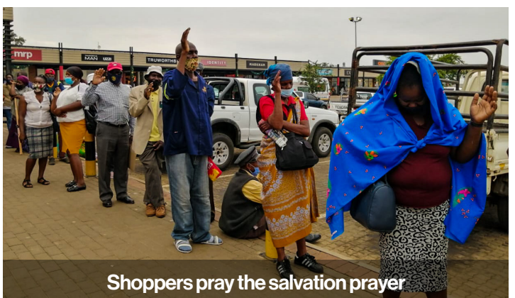
Shoppers pray the salvation prayer