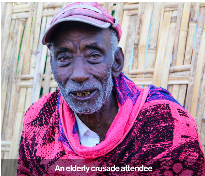
An elderly crusade attendee