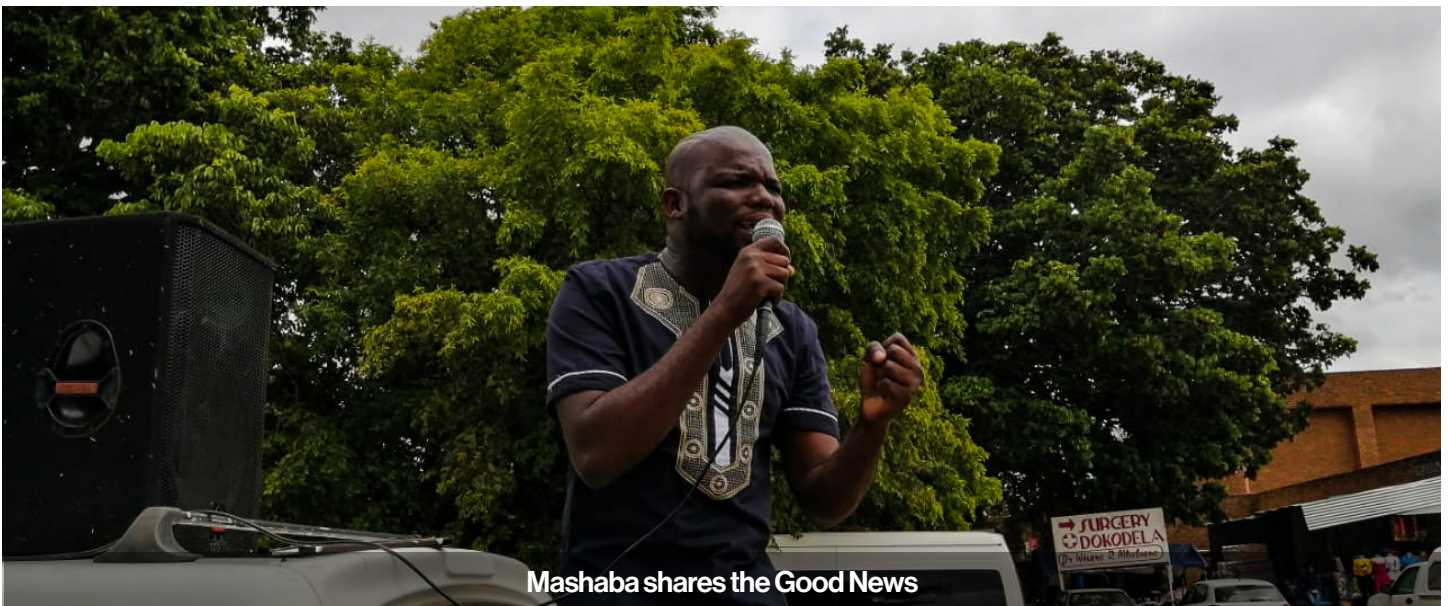
Mashaba shares the Good News