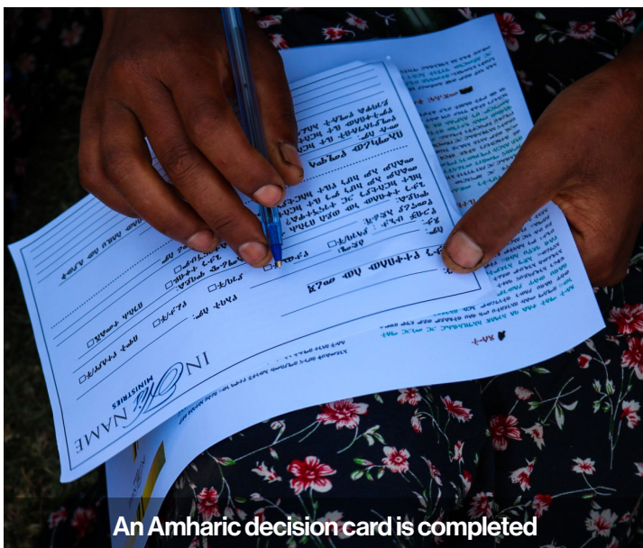
An Amharic decision card is completed