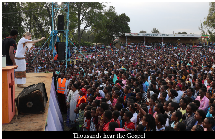
Thousands hear the Gospel

Our time in Ambo was extraordinary (31 October - 3 November). Crusades are always rife with challenges but the final week leading up to our meetings in Ambo and the first meeting itself, made it feel as if the devil was fighting this soul-winning endeavour with an extra degree of ferocity. The week prior to our crusade was an extremely violent one in Ambo. Political protests erupted that resulted in close to eighty deaths and the town being on lockdown for four days. Miraculously, the local authorities did not cancel our upcoming mass gathering - which is the customary response in Ethiopia following an uprising - but, following the lockdown, permitted that we continue with our preparations. Continue we did, rushing to catch up on the precious days of planning lost and encouraging both pastors and believers that now was not the time to shrink back in fear but rather, now was the time to preach the Gospel! When the day before our crusade arrived, the setting up of stage, sound and the like having been completed, another challenge besieged our team.