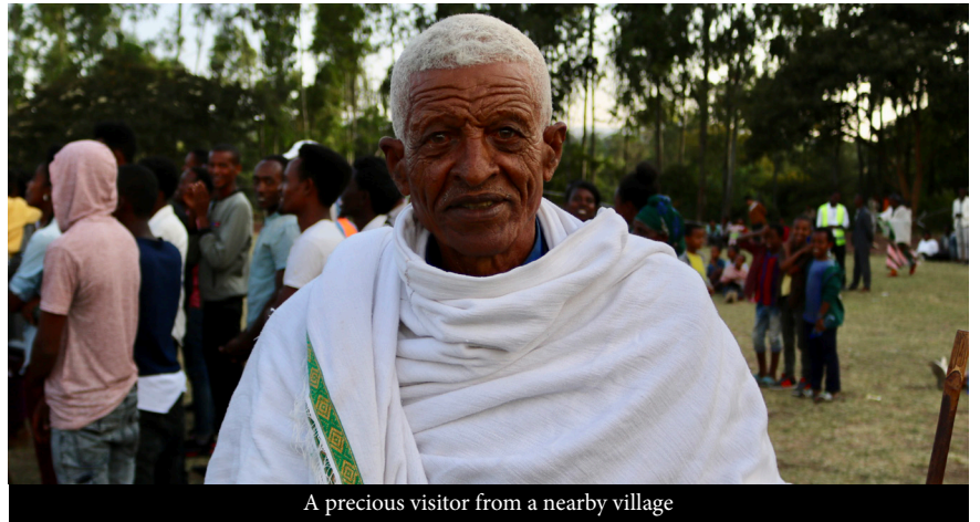
A precious visitor from a nearby village