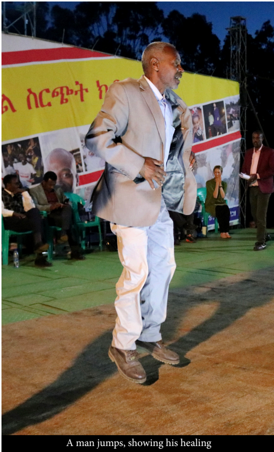
A man jumps, showing his healing