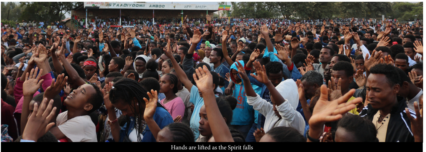
Hands are lifted as the Spirit falls