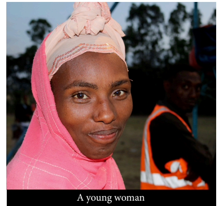
A young woman