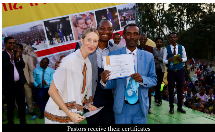
Pastors receive their certificates

Late that afternoon, we were informed that the Prime Minister was landing the next morning via helicopter in the local stadium – our crusade grounds – to meet with authorities. Protocol required that our entire sound and stage set-up be removed due to security concerns. When he left in the afternoon, we had only a few hours to erect enough equipment to hold the first day's service. The team did spectacularly well but by the time we got going, the lateness of the hour made many too nervous to attend, protesters having been stirred up again by the coming of the Prime Minister. Yet, preach the Gospel we did and a river of salvation and healing started to trickle into Ambo. The next morning, we finished setting up all equipment and that evening, the trickle turned into a floodtide! A surge of salvation and liberation was at hand.