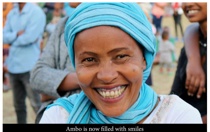
Ambo is now filled with smiles