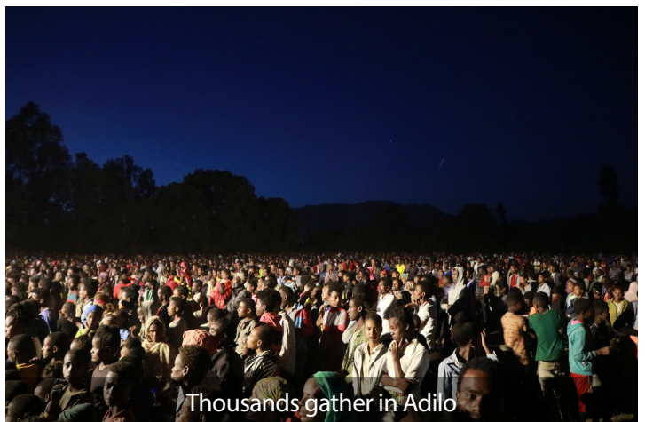
Thousands gather in Adilo