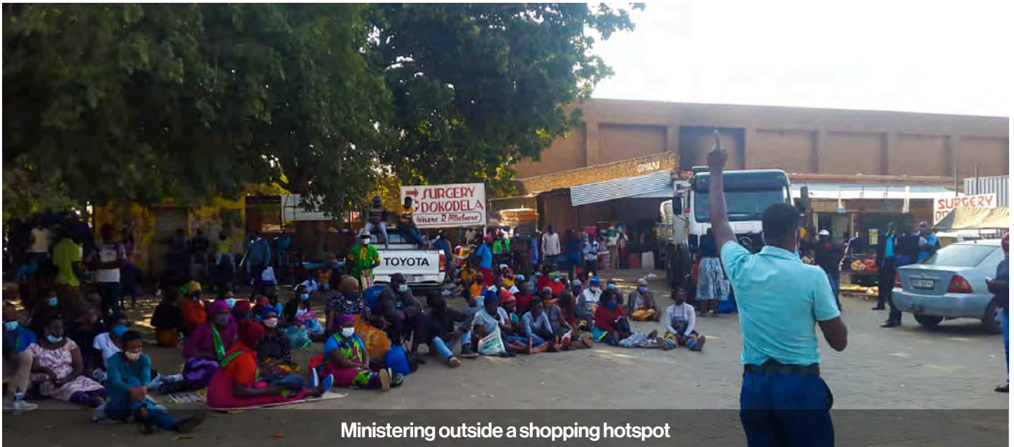
Ministering outside a shopping hotspot