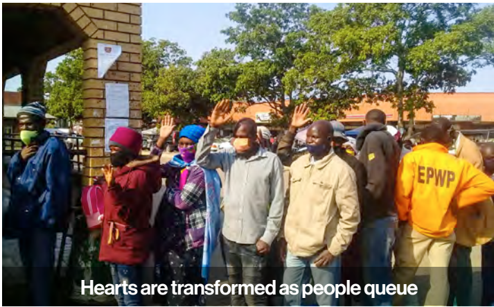
Hearts are transformed as people queue