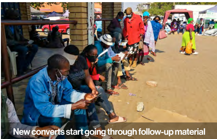
New converts start going through follow-up material