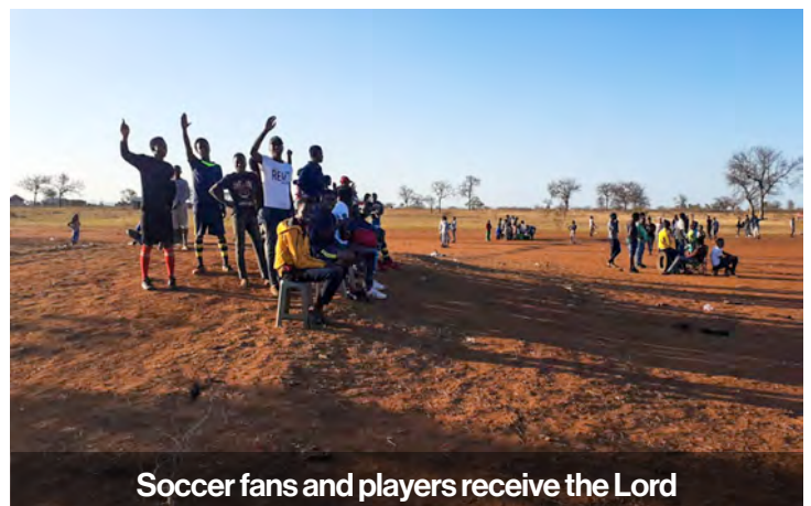
Soccer fans and players receive the Lord