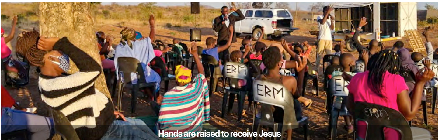
Hands are raised to receive Jesus