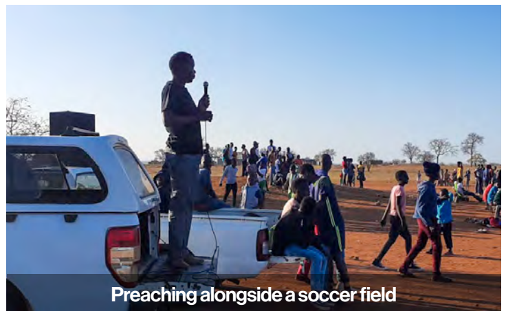
Preaching alongside a soccer field