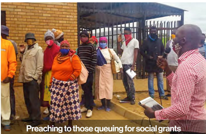
Preaching to those queuing for social grants