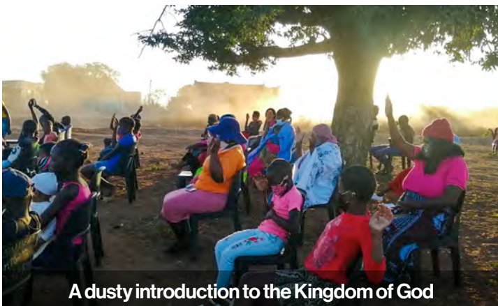
A dusty introduction to the Kingdom of God