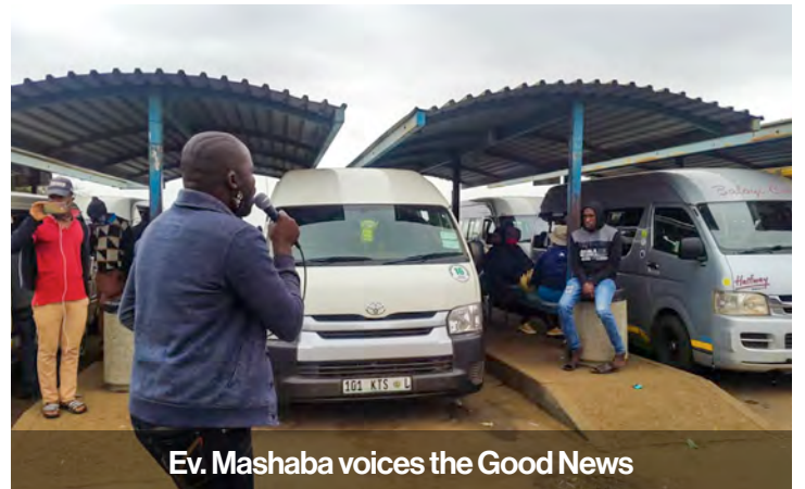
Ev. Mashaba voices the Good News