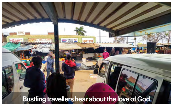
Bustling travellers hear about the love of God