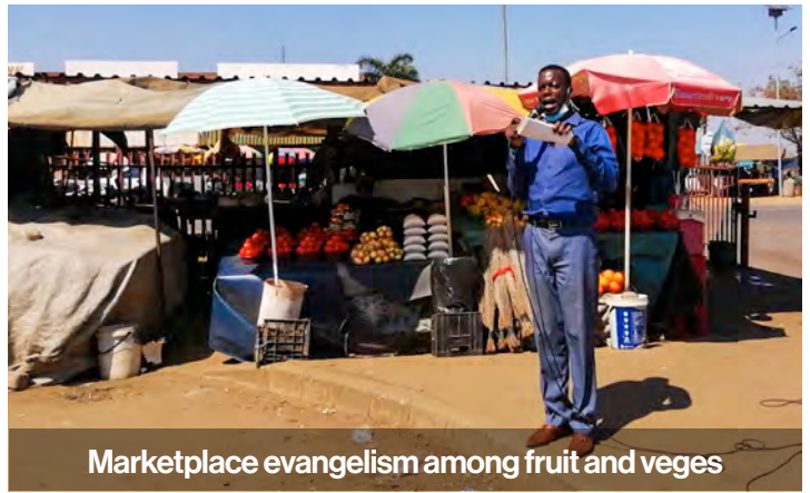
Marketplace evangelism among fruit and veges