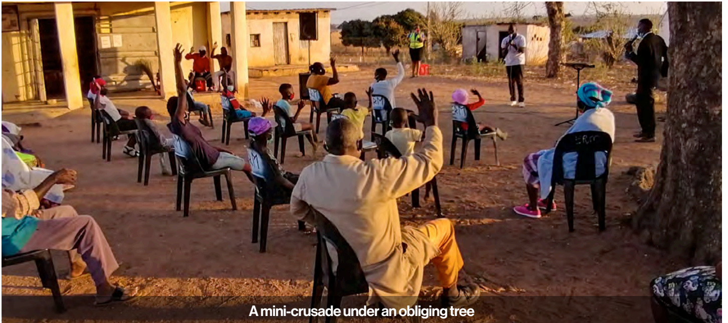
A mini-crusade under an obliging tree

The list of different villages and towns that have been impacted over this past month is extensive. Such include Malonga, Hanani, Mavhulani, Vuwani, Mudabula, Nghalalume, Kurhuleni, Muswane, Nhombelani, Navelani, Shigamani, Gumbani, Malamulele and Giyani. At present, while we wait for larger, mass gatherings to be allowed in South Africa and Ethiopia where our remaining crusades for this year shall - by the grace of God - still be held, we will keep on winning the lost in the highways and byways of Africa, one mini-crusade at a time! We thank you for your continued financial and prayer support. Without you, none of these soul-saving endeavours would be possible.